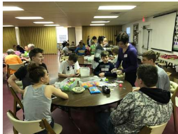
Scenes from the youth group service activity with Bridgeport Presbyterian Church.